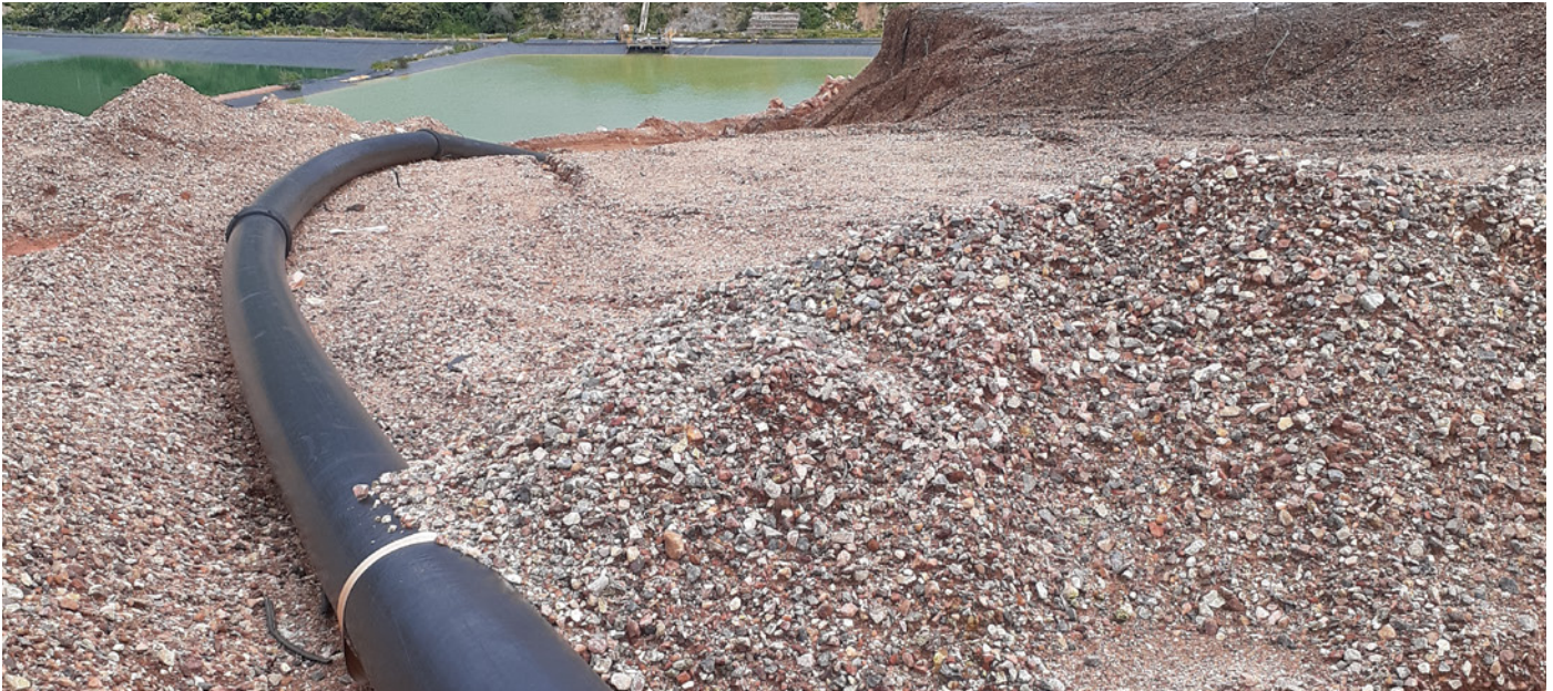
Pexgol pipe installation for the transport of cyanide water.